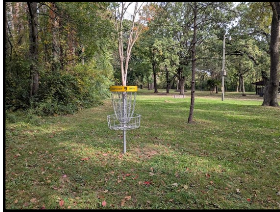
Disc Golf Basket at North Woods Park

The North Woods Park course offers two layouts where you have the opportunity to throw from a more beginner tee pad or challenge yourself to a more experienced level pad. The long course for hole 2 is one of the favorites, offering the opportunity to throw from the top of the hill to the basket below. Hole 4 is another unique challenge as you find yourself throwing over a wet oxbow and between trees to get to the basket. Currently a student with Hawkeye Community College is helping create signs for the 14 tee pads as part of a graphic design class. You can find the course online at North Woods Park - Summer, Iowa | UDisc Disc Golf Course Directory . We look forward to seeing more people out enjoying a new activity while camping or just coming out for the day.