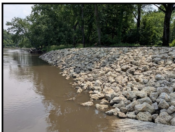
Rip rap along streambank at North Cedar Park

The second project I want to highlight is the addition of a 9-hole disc golf course at North Woods Park. The sport of disc golf continues to grow in popularity. What's nice about disc golf is that a person does not need a lot to get started. There are no fees to use the course, and it takes as little as one disc to go out and play. Like many sports, a person can fully dive in and purchase a back pack full of drivers, putters, midrange discs that go left, discs that go right, etc., but if you are a beginner, feel free to come out and throw whatever you have. To work through this project, it took the expertise of avid players.