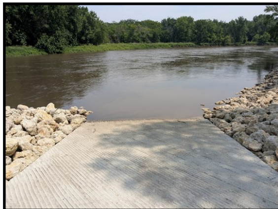
New Concrete Boat Ramp at North Cedar Park

Our spring Bremer Bulletin made mention of plans for constructing a new concrete boat ramp at North Cedar Park. I am pleased to say that the construction crew was able to get the ramp and rip rap put in place early this summer. Up and down river levels made work a bit more challenging, but levels worked out long enough to get it all completed. With relatively high-water levels throughout the entire summer, the new ramp did not see high usage, however the river is now in great condition, and usage is increasing. Fall is a great time to check out the new ramp and experience some of the best fishing of the year on the Cedar River.